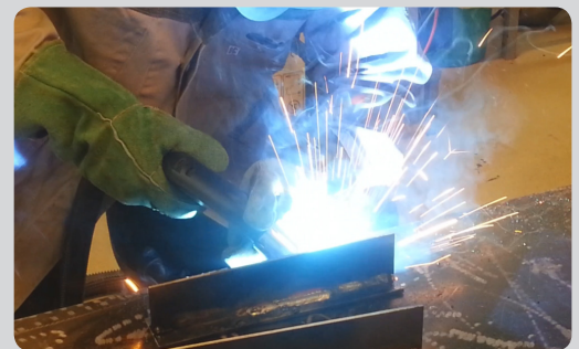
DIX MRZ 304 / without fume extraction

DINSE provides the right equipment for every application. The new flue gas extracting welding torches are available in gas- and water-cooled versions.