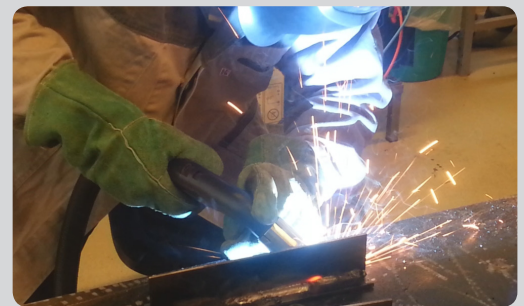
DIX MRZ 304 / with fume extraction